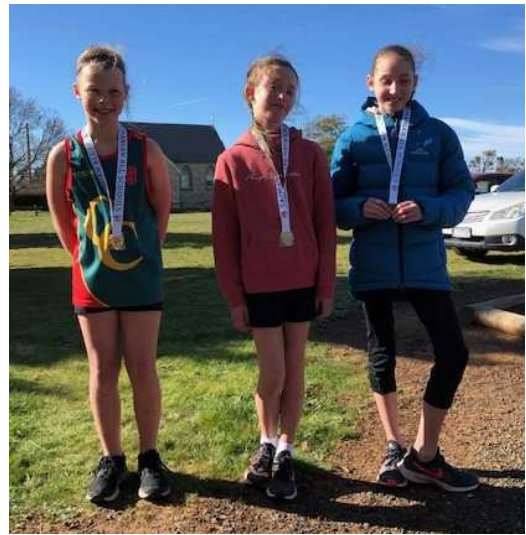
Right: some of the youngsters