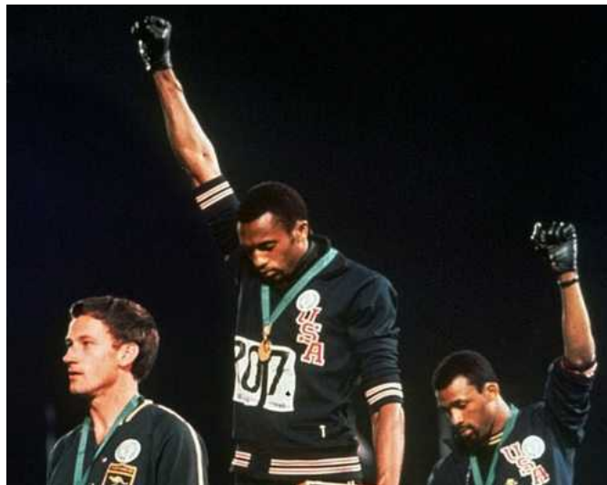
1968 Podium for 200 Meters

Confused? Bear with me. Let's start in 1968. Tommie Smith (USA) won the Men's 200 Meters at the Olympic Games. His countryman John Carlos was third, Australian Peter Norman second. During the podium ceremony, all three wore human rights badges on their track suits. During the playing of the U.S. national anthem, the two American Black athletes, Smith and Carlos, raised their fists, Smith his right fist, Carlos his left fist. The Black Power salute seen around the world. Both were shoeless and wore black socks. Smith wore a black scarf to honor black pride. Carlos wore a necklace of beads to honor lynching victims. Smith and Carlos were expelled from the Olympics. All three medalists endured abuse for their podium gestures for decades before they came to be seen as courageous. The two Americans served as pall bearers at the funeral for their Australian friend Norman, who died in 2006.