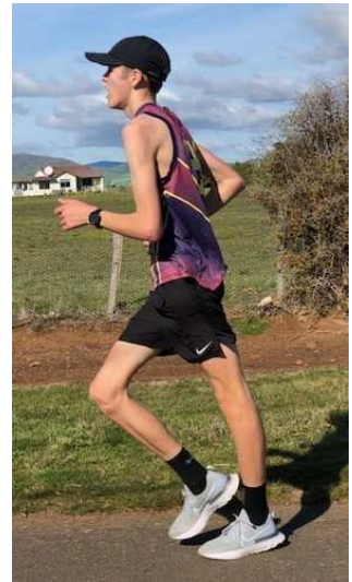
More action from Saturday