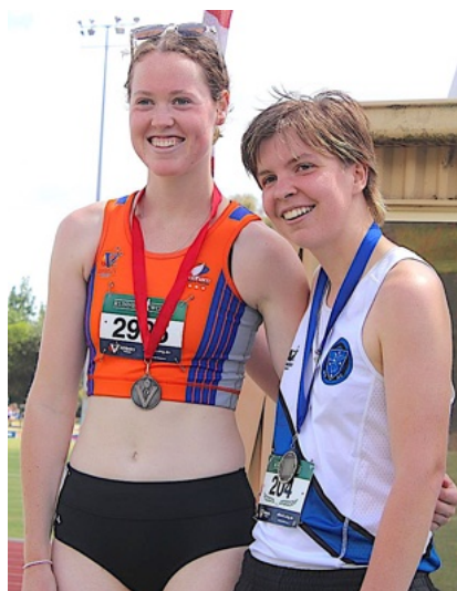
What's not to like about some new bling?