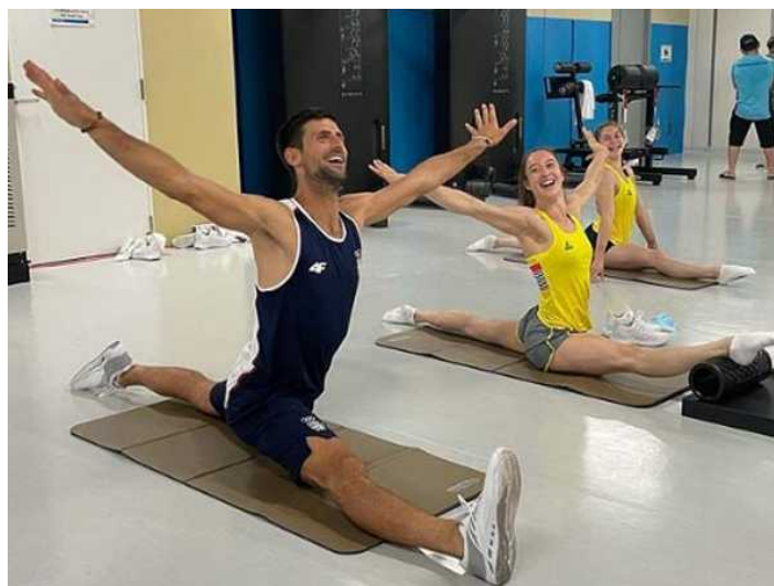
Novak Djokovic, today's equivalent of Larry Young, in Tokyo with Belgium's Olympic gymnastics gold medalist Nina Derwael

takes. Klopfer calls Young as “extremely flexible” back in the day. During the three-day interval between the 20 and 50Ks at the 1972 Munich Olympics, all Young did was stretch.