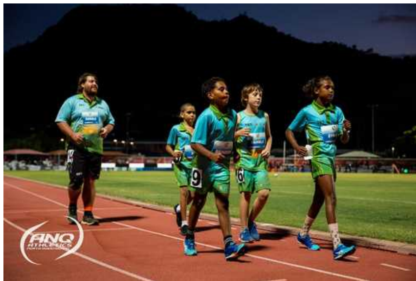
A bunch of kids from the remote town of Normanton having a go in the walk with their coach last Friday evening in Townsville