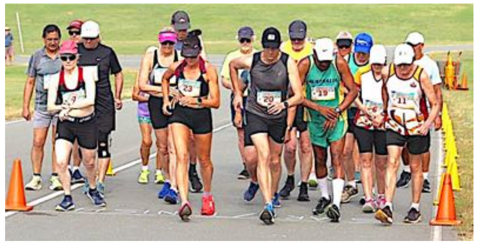
The toughies tackle the '10' at Runaway Bay.