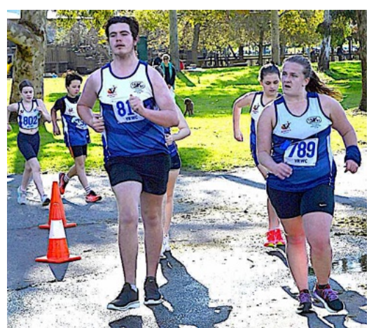
This race walking ... it really drives you 'round the bend! 1