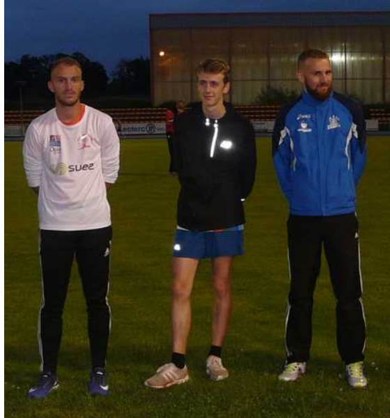
The leading men and women