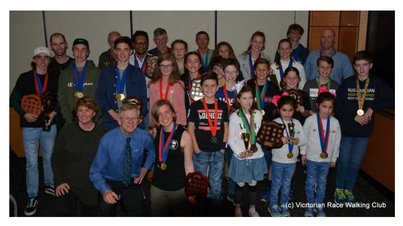
Some of our great RWV team at the Sunday night presentations in Canberra last weekend

You can read the finer details later in the newsletter.