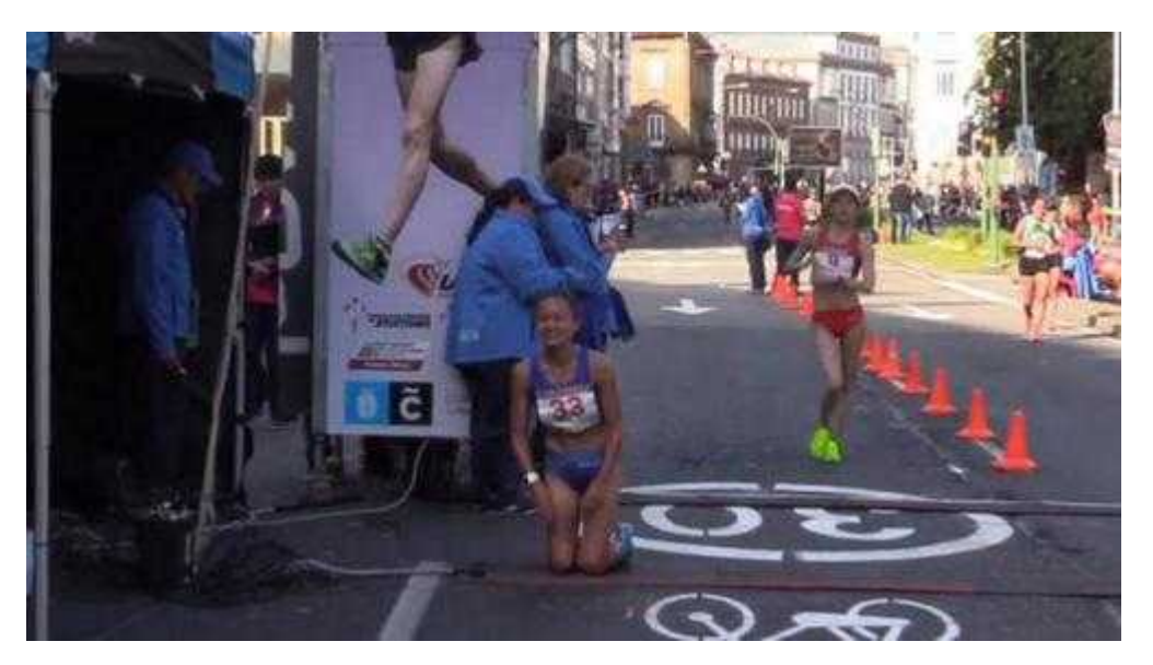
Glenda Morejon crosses the line in first in a World U20 best time of 1:25:29

Morejon is a real powerhouse walker – see youtube video of her in La Coruna: <u>https://www.youtube.com/watch?v=N1eCgSq3L8I</u>. And check out the photo gallery at <u>http://tufotocorriendo.com/lang/es/compra-tu-foto/xxxiii-gp-internacional-marcha-los-cantones-2019</u>.