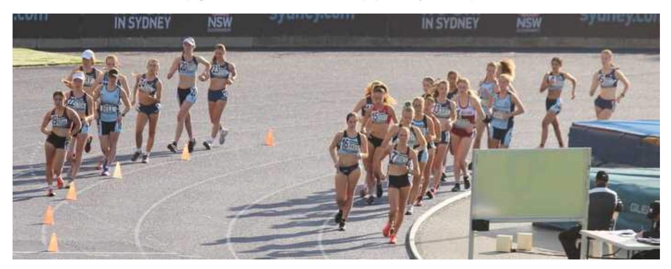
The start of the U17 and U18 Girls' 5000m Walks in Sydney