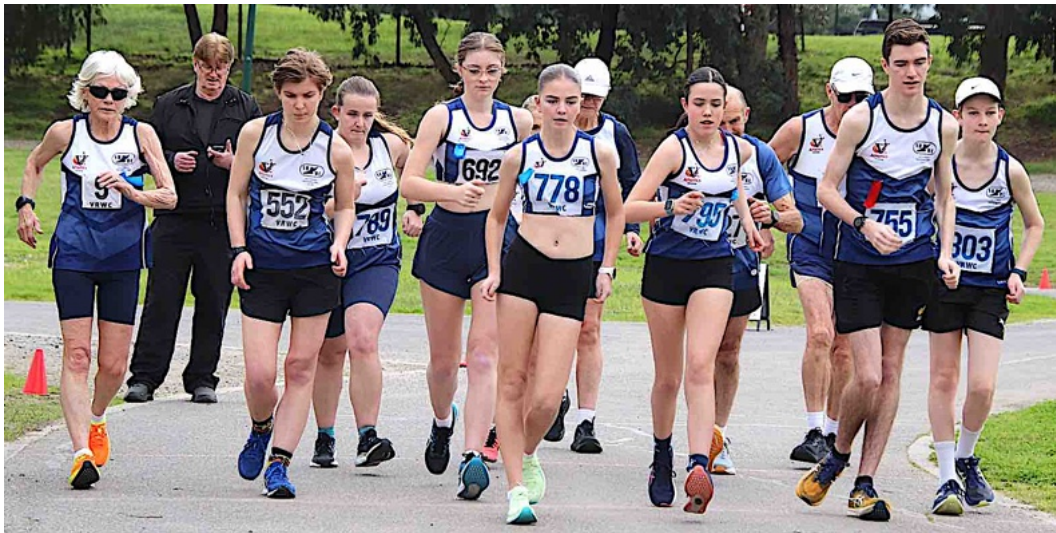
The 8, 6 and 4km starters have their eyes on the prize(s).