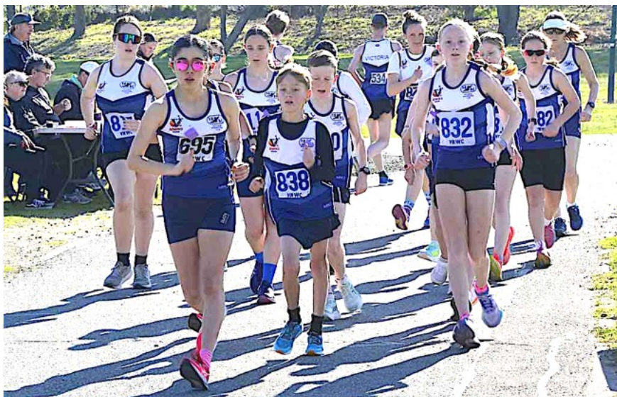
The 2km 'mega-field' sets off.

If PB times were made of hay, you'd figure the sun had to have been shining on Saturday, and you'd be right. On a day on which, unfortunately, dangerous weather washed out competition in both NSW and WA, the 42 walkers (20 more than at the same time last year) who fronted at Middle Park were gifted glowing sunshine, without wind or wind chill, and twenty went home with new best or equal best times. Talk about proving a proverb true!