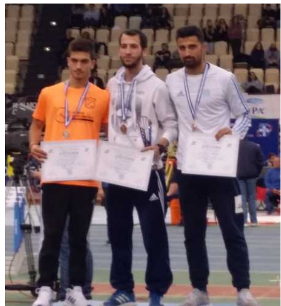
Men's and women's fields and podium placings