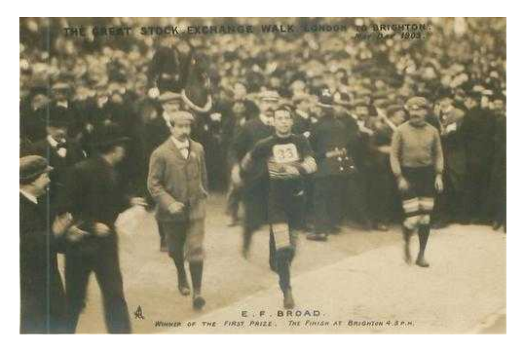
Winner E. F. Broad breaks free of the crowds to win the 1903 Stock Exchange Walk from London to Brighton