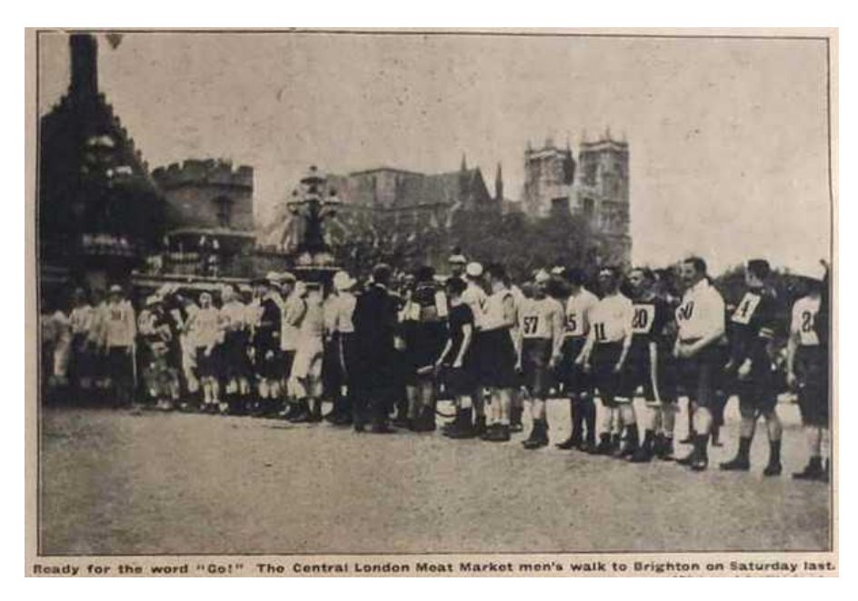
Ready for the word "Go!" The Central London Meat Market Men's Walk to Brighton on Saturday last

Many organisations featured their own London to Brighton walks. The earliest races were promoted by the now defunct Hairdresser's A.C. and the Polytechnic Harriers. One interesting press clipping documents a further London to Brighton walk that took place in 1983. It was billed as The Butchers' Walk.